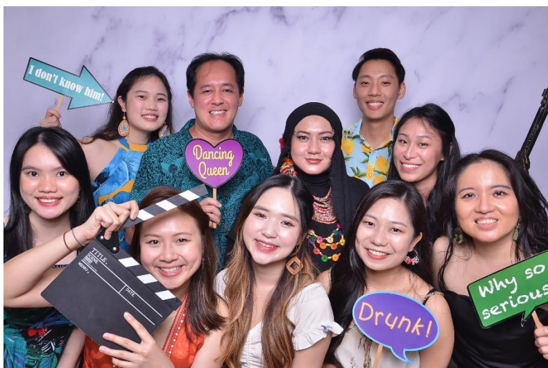
The RDS Capital Markets Team

https://www.thestar.com.my/business/business-news/2022/09/20/ame-reit-debuts-on-main-market-at-rm114